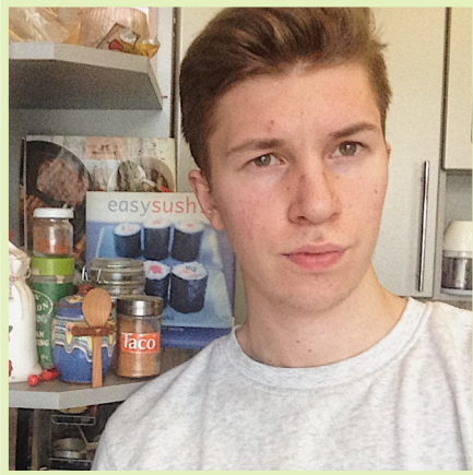
D. Ermakov group 3941-0/2-2

the sense of inner fulfillment. It's when you've set a goal, the tasks of which you can complete. The process of completing these tasks, combined with the confidence of one day achieve your goal, is happens as I see it.